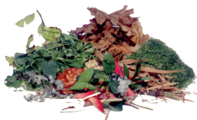
Grass cuttings and hedge clippings