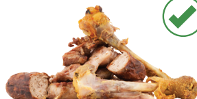
Meat, bones, fish and pet food