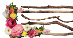
Small branches and flowers