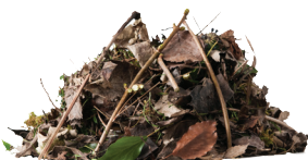
Leaves and prunings