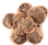
Tea bags and coffee grounds