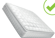
Beds & Mattresses

Avoid a £1,000 penalty charge - use your bulky items collection service.