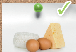
Eggs and dairy products