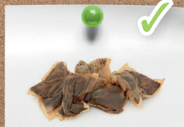
Tea bags and coffee grounds