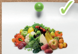
Fruit and vegetables