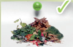
Grass cuttings and hedge clippings