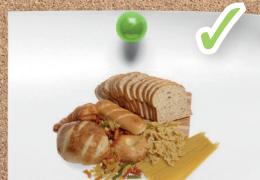
Bread, pasta and rice