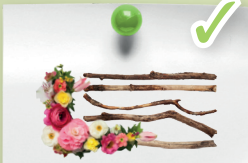
Small branches and flowers