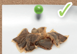
Tea bags and coffee grounds