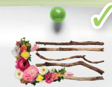
Small branches and flowers