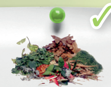
Grass cuttings and hedge clippings