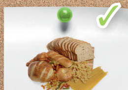
Bread, pasta and rice