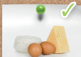
Eggs and dairy products