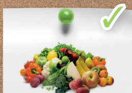
Fruit and vegetables