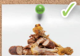
Meat, fish and bones